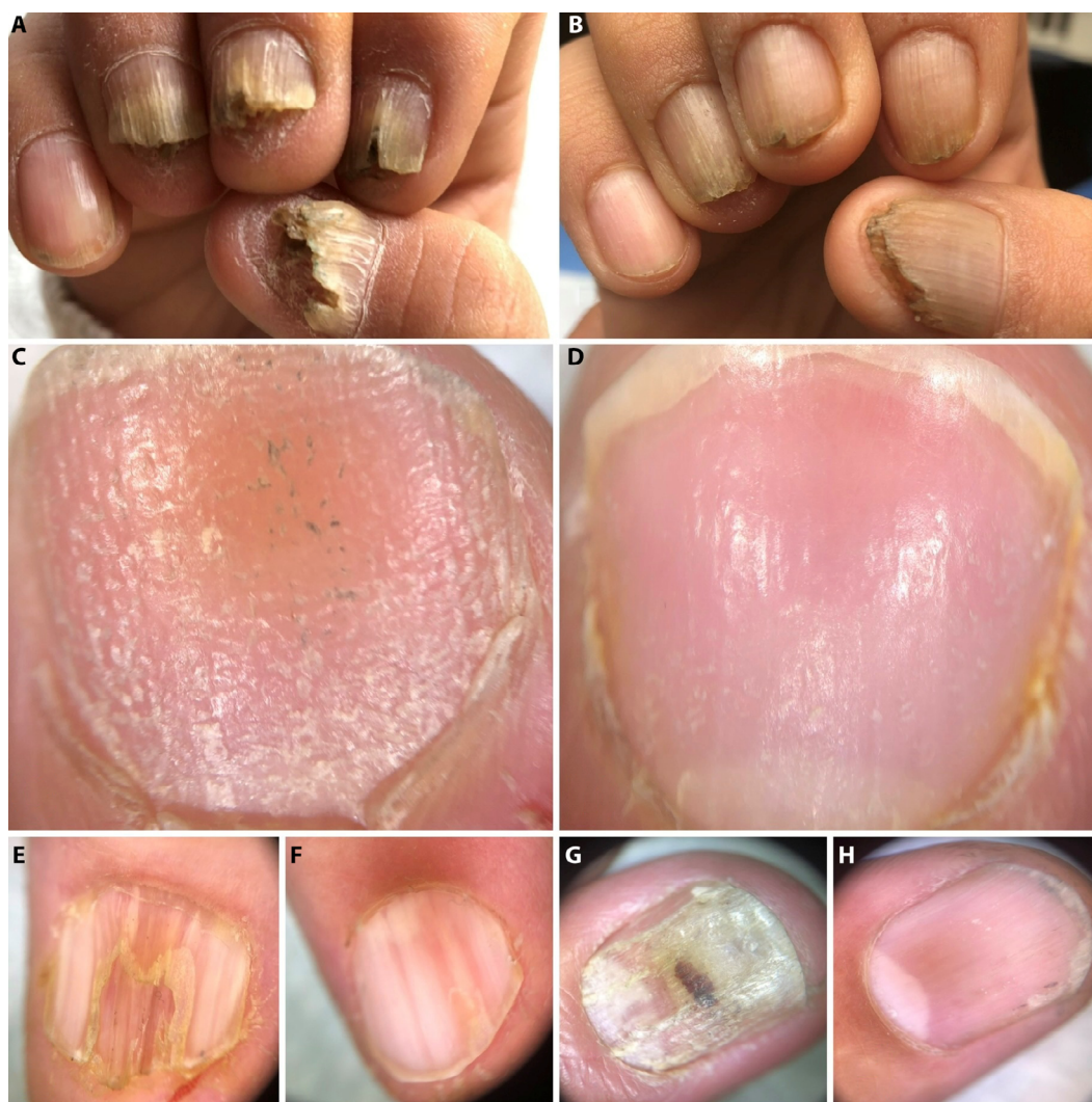
Figure 2. Clinical and dermoscopic improvement of nail psoriasis following laser-based therapies, quantified using the modified Nail Psoriasis Severity Index (mNAPSI). (A, B) Clinical images obtained before (A) and after (B) six sessions of IPL, demonstrating marked regression of onycholysis, crumbling, and subungual hyperkeratosis, with a substantial reduction in mNAPSI score from 18 to 4. (C, D) Dermoscopic images before (C) and after (D) six sessions of Nd:YAG laser, showing a significant decrease in pitting and leukonychia, reflected by a decline in mNAPSI score from 5 to 1. (E, F) Clinical response before (E) and after (F) eight sessions of IPL, with resolution of crumbling, splinter hemorrhages, and oil-drop patches, accompanied by a reduction in mNAPSI score from 7 to 1. (G, H) Clinical images before (G) and after (H) six sessions of IPL, demonstrating improvement in onycholysis, hemorrhage, and discoloration, with a corresponding decrease in mNAPSI score from 7 to 1.