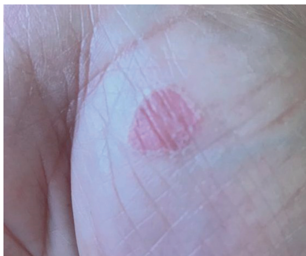
Figure 1. Clinical image of a single well-demarcated, erythematous plaque in the thenar eminence of a 63-year-old woman.

A 63-year-old woman, with a history of high blood pressure and Waldenström macroglobulinemia, presented to our department for the evaluation of a solitary well-demarcated depressed plaque in the thenar eminence of the left hand that had been present for 10 years (Figure 1). The patient denied any associated symptoms or previous trauma. Dermoscopy showed a stepped-scaly border and punctate vessels on an erythematous base, with regularly distributed white dots (Figure 2). A biopsy was performed that revealed a thinning of the stratum corneum and a slightly diminished stratum